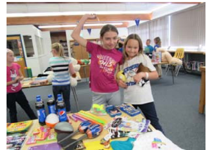
February AR Store