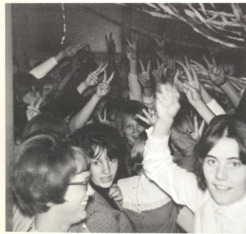
How many girls will fit in the G. R.? In 1970 the answer was 80.

For many women who graduated from Goessel High School the letters G.R. may conjure up memories of a small, narrow, room. A room where only senior girls were allowed, although senior boys often found their way inside.