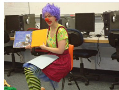
Skippyjon Jones storytime with the Clown