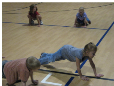
Students try the crab walk.