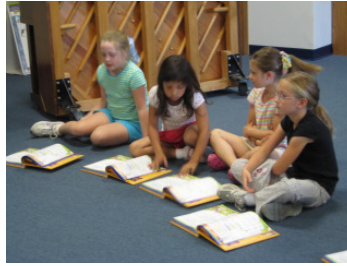
2nd grade enjoy the fall BBQ, music and PE