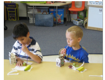
© Roy & Dawson have milk break.