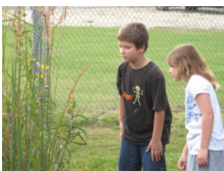
Students spend time learning in the nature center

aquarium in Chicago. It is cool you can see beluga whales and more. I love to go to the library and read the whole series of Arthur books. Learning how to drive a four-wheeler in second gear. When my mom came to school and I got her sherbert and cookies. Riding our dazzling horse Silver because it feels good. Going to the toy part of Wal-Mart. I like to go to school because I get to see all my friends and sometimes my teacher. Playing with my best friends, sweet, sweet friends.