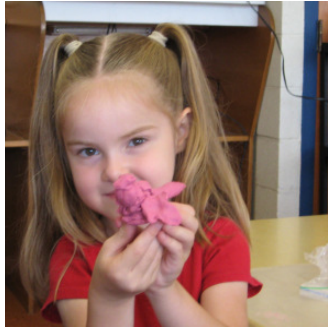
Kindergarten made clay monsters after reading the book, "Leonardo the Terrible Monster"